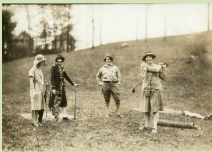
Huron Hills GC Opens 1922