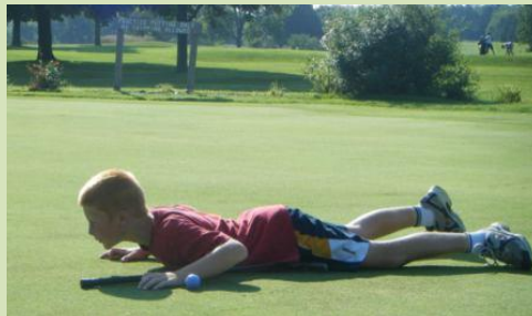
Lining up a putt at the Herb Fowler

The Board will meet frequently in the first year of operation, eventually establishing regular monthly meetings.