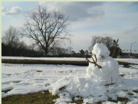
A snowman prepares to chip to the ninth green.