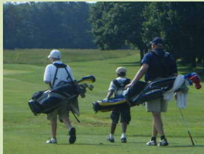
Golf Camp at Huron Hills