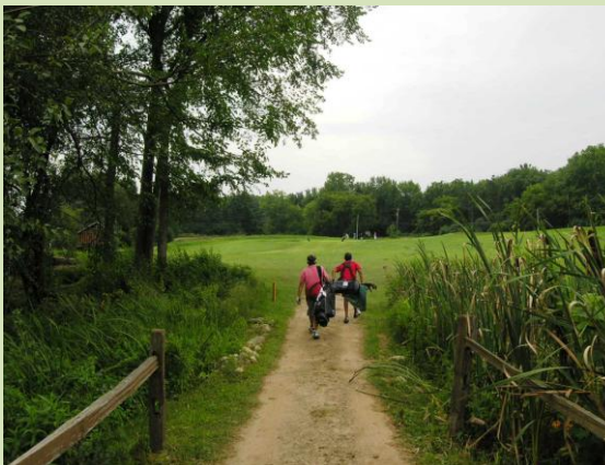
Herb Fowler Jr. Tournament 2010

Development and Delivery of Recreational Golf Opportunities at Huron Hills Golf Course