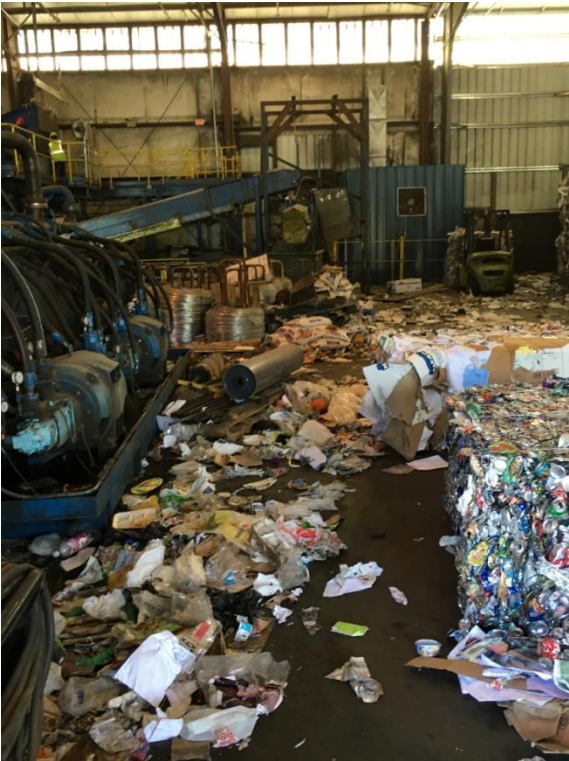
Unsecured blockade / railing