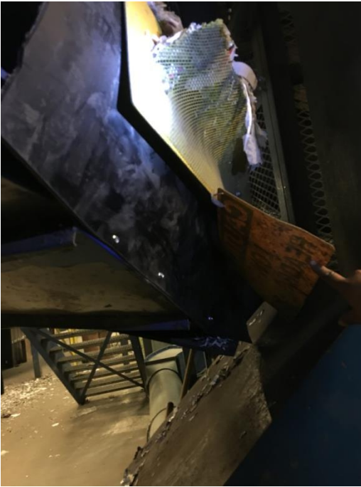
Corrected material build-up on conveyer roller