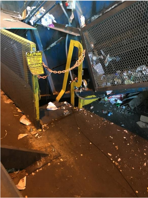
Corrected blockage of baler E-stop