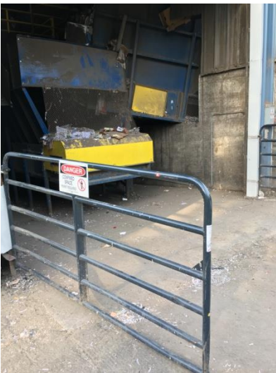
Emergency exit blocked with material

Improperly secured confined space. Work was being conducted within the space w/ no confined space protocols or proper securing of the space. No attendant, no signage, and no observation of confined space permit were present. Proper lockout / tagout was observed by contract employees. If ReCommunity feels this space needs to be re-classified, then documentation will be required and the rationale for re-classification will also need to be provided..