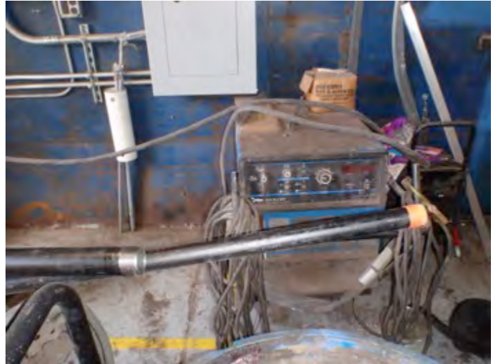
Top right: Electrical panel blocked