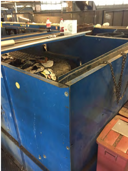
Bottom right: E-Stop line not secured as designed to 3 rd floor sorting conveyor