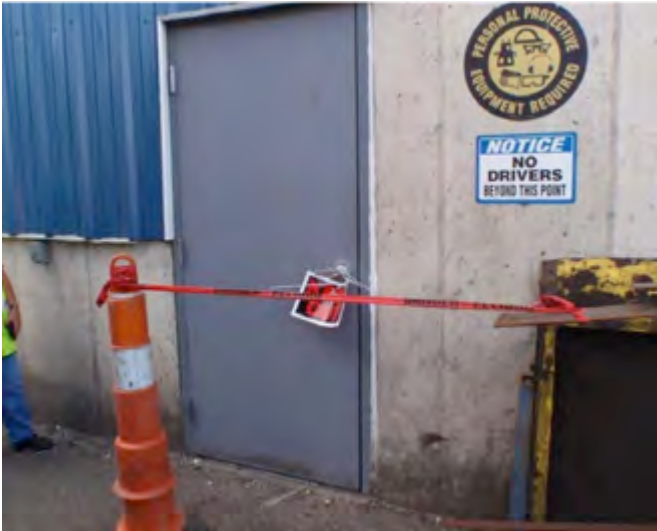
Emergency exit blocked by danger tape and cone.