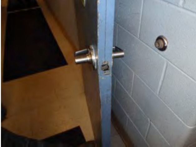
Top left: Door latch missing