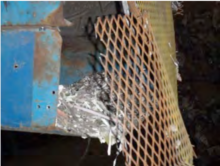
Loose guarding on conveyor.