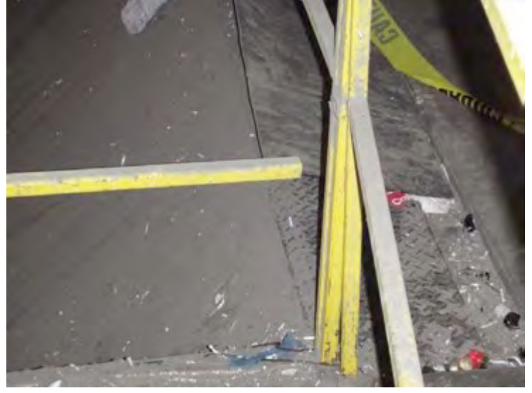
Hand rail needs repair in two spots