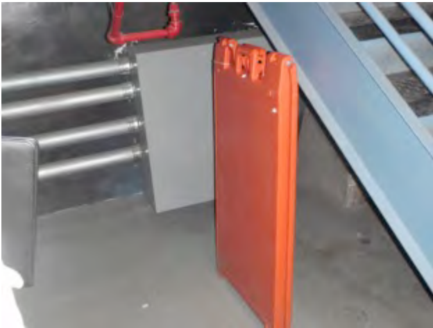
Top left: blocked electrical panel