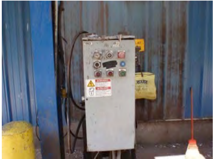
Button switch missing on control panel.