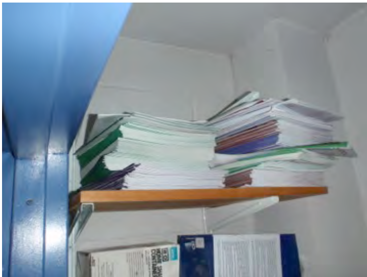
Bottom (both): Closet needs to be cleaned