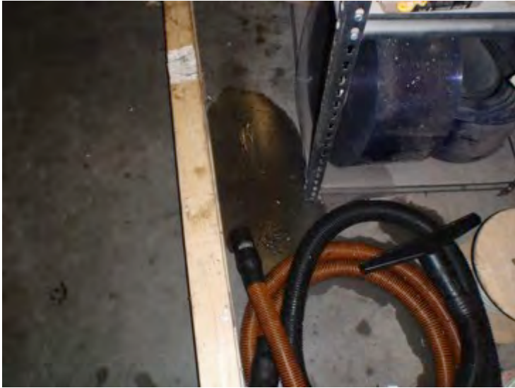
Oil spill in storage closet.