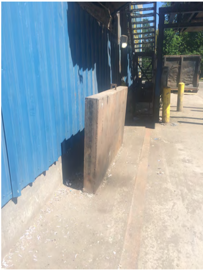
Improper materials storage: crush hazard