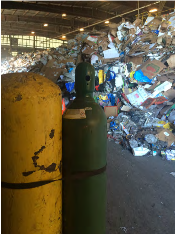
Cylinder stored next to mountain of paper/cardboard [CGA P-1 1965, 3.3.6]