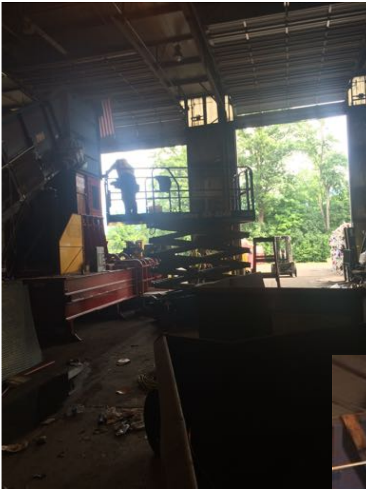
Left: No fall protection