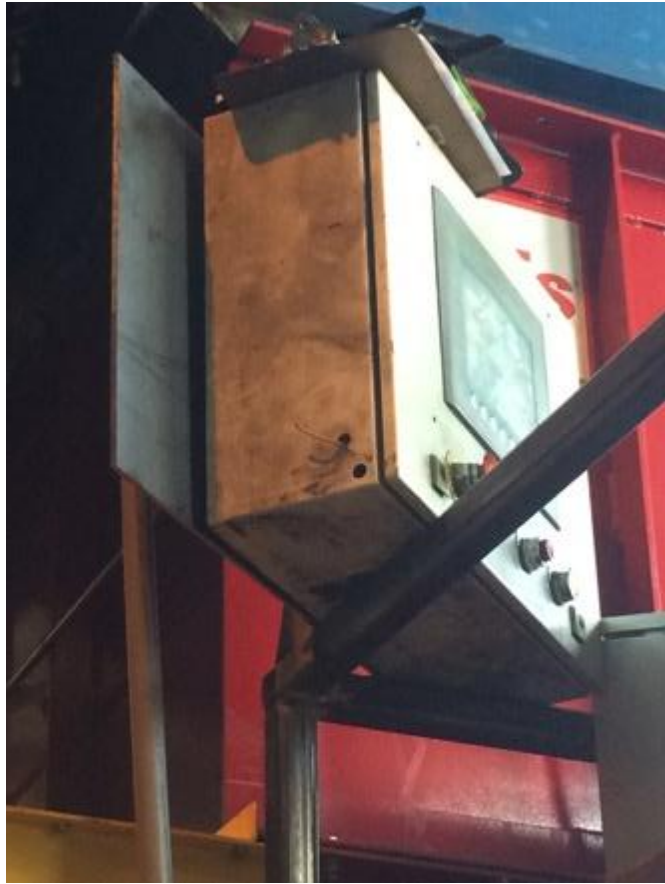
Top left: missing switch on conveyor

Top right: (Heads up) Panel hasn't been mounted yet, but when it is please make sure it is mounted such that the panel door is able to be opened/closed, proper working clearance is maintained, and that the unused holes on the front, sides and top of the enclosure are closed up.