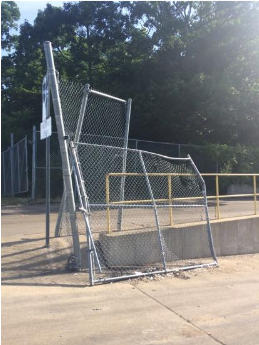
Transfer station gates broken