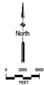
Exhibit C – Location Plan