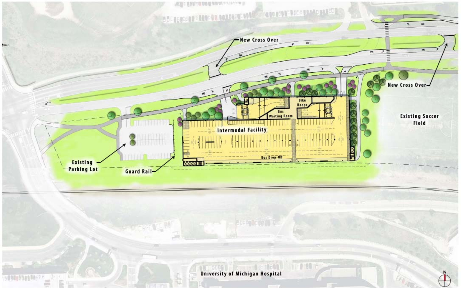
Exhibit A – Fuller Road Station: Phase One Concept Plan