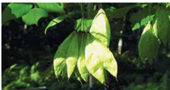
Bladdernut produces floating capsules to disperse its seeds downriver.

– Justin Heslinga natural resources technician