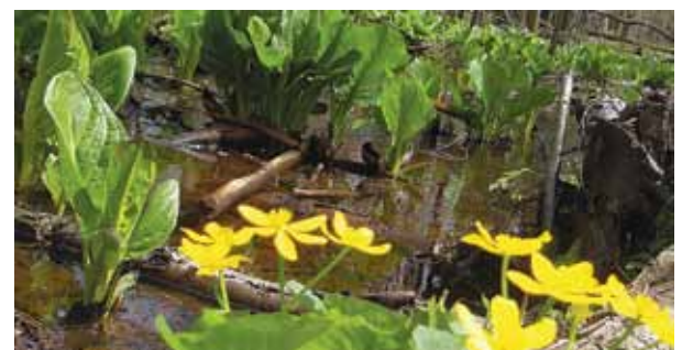
Skunk cabbage and marsh marigold emerge from a vernal pond.