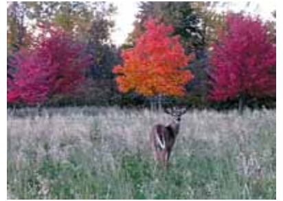
Ages 5-12 | Mckensie Winn