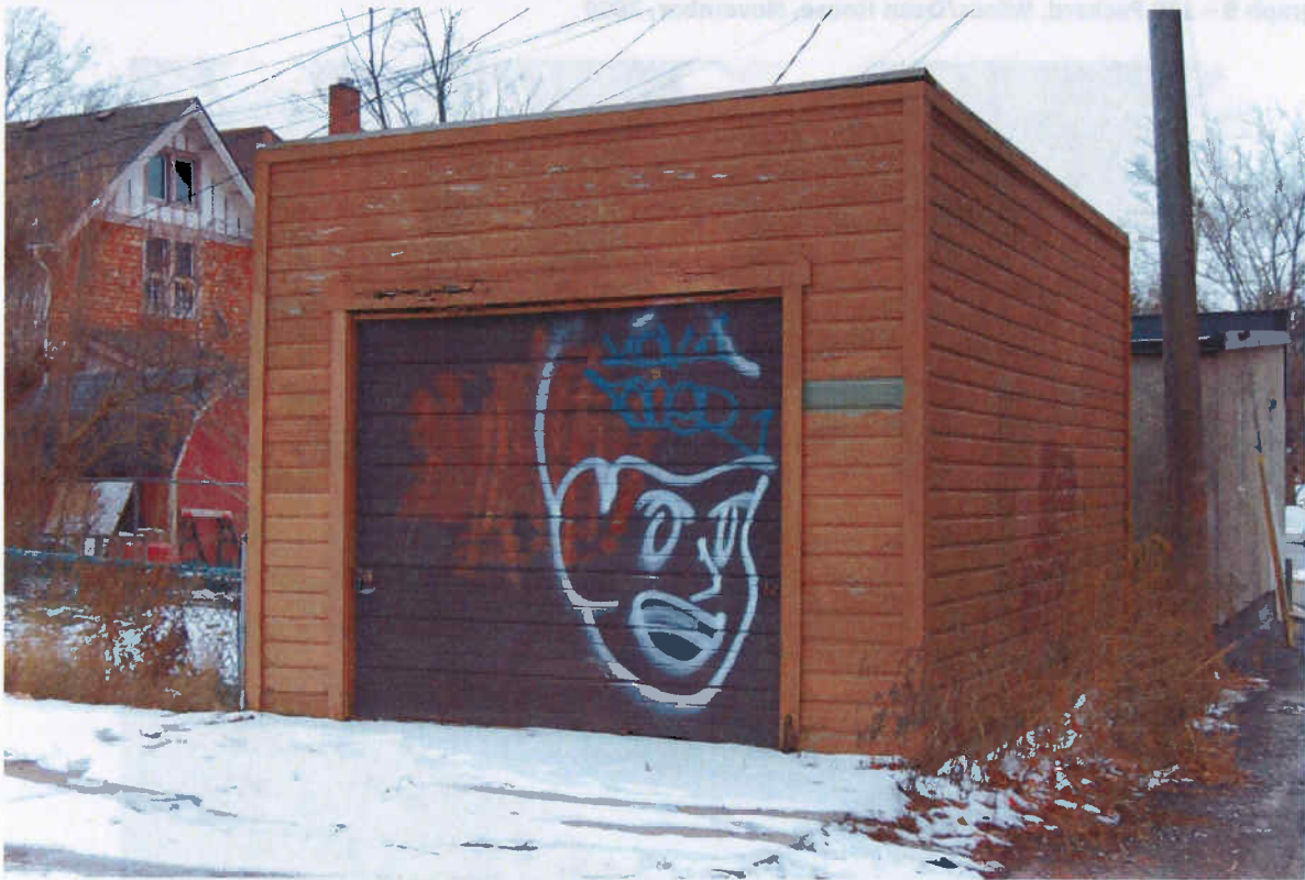
Photographs 7 & 8 – 432 South Fourth Avenue, house (Bethlehem Church parsonage) and garage, September 2009, February 2010