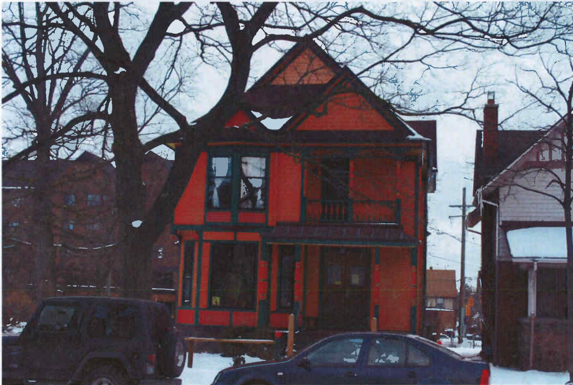
Photograph 12 – 442 South Fourth Avenue, Gottlieb Wild house, February, 2010