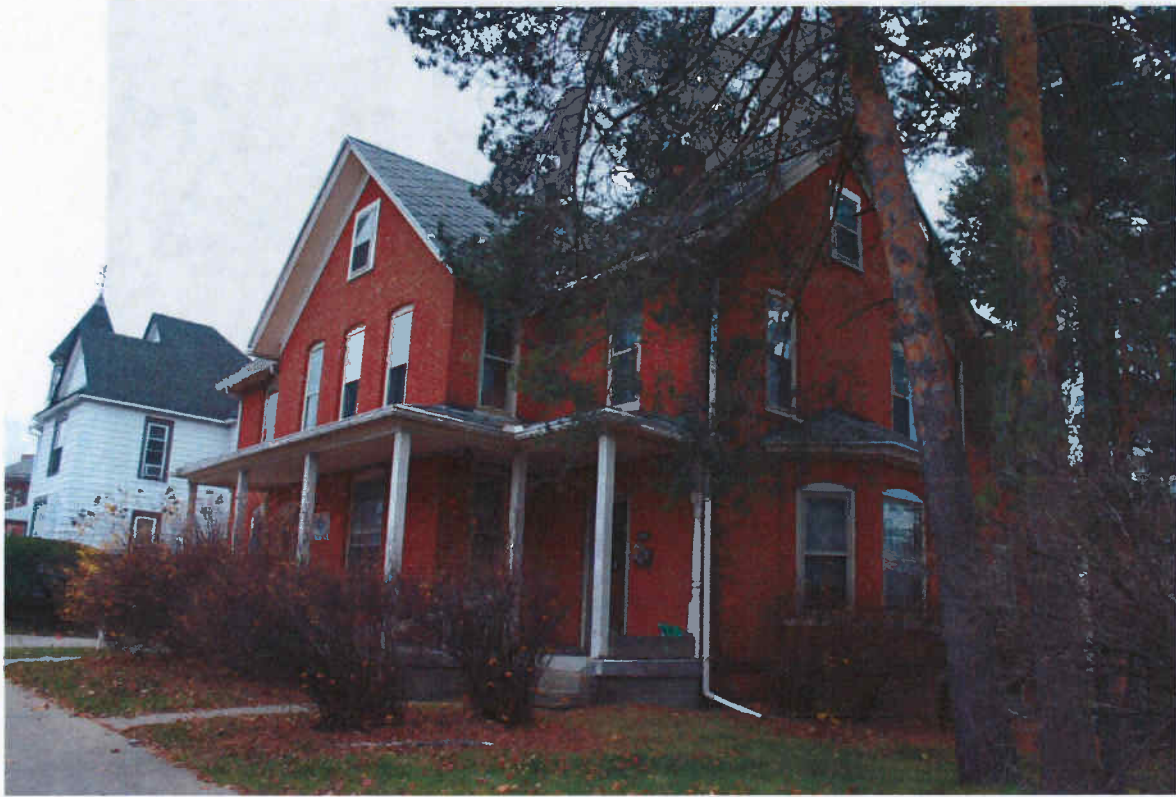
Photograph 11 – 300 Packard, November, 2009