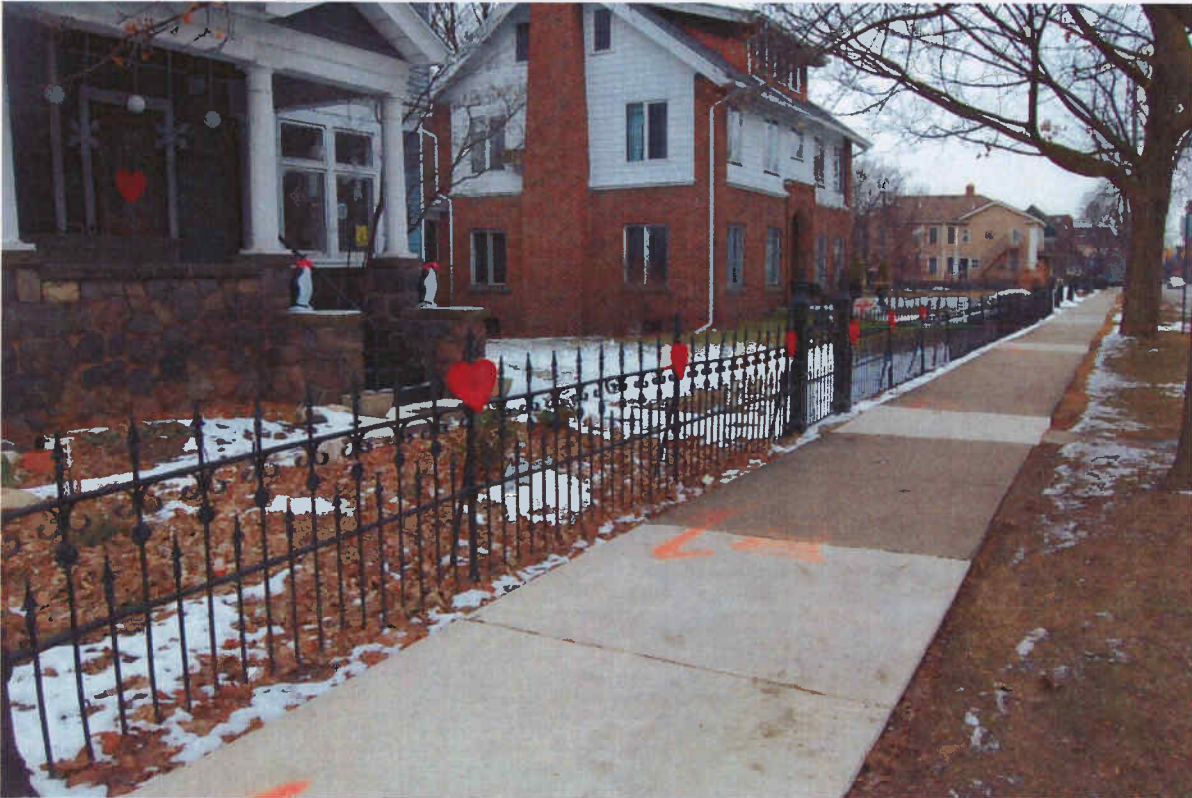
Photograph 16 – Wrought iron fence at 444 and 438 South Fifth Avenue, looking north, February, 2010