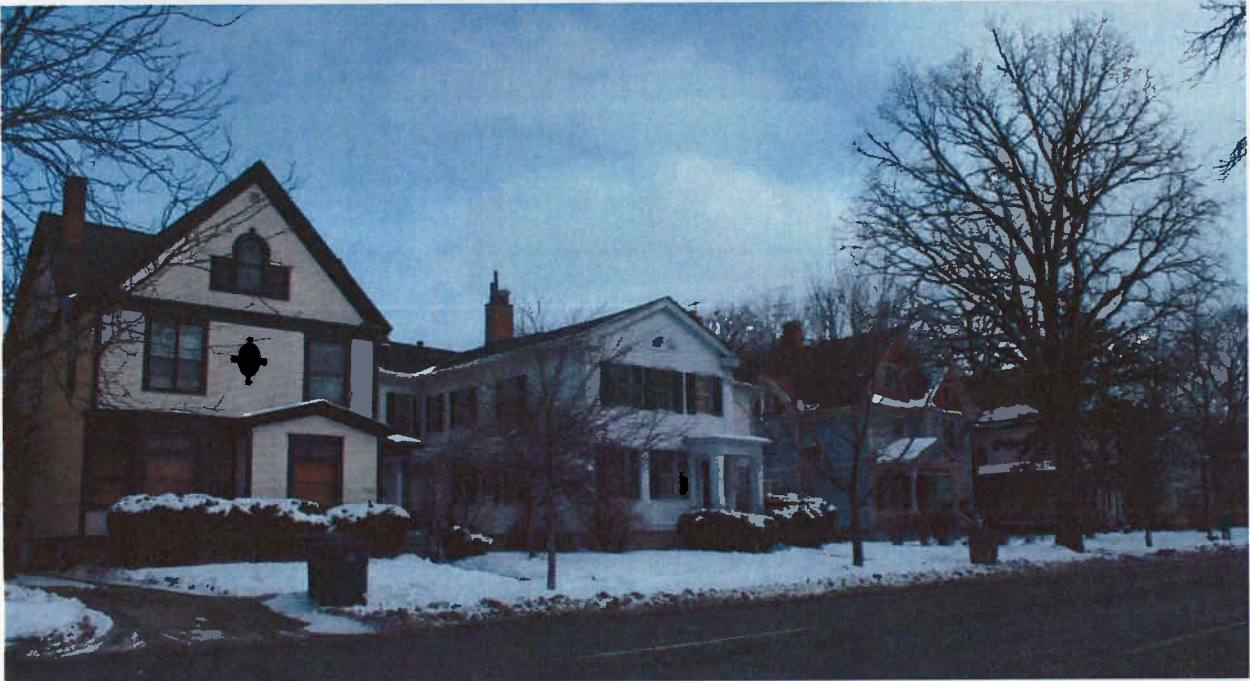
Photograph 1 – East side of Fifth Avenue looking south, February, 2010