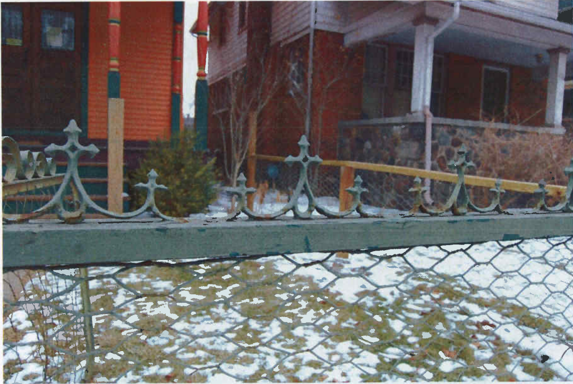
Photograph 13 – Detail of wood and wrought iron fence at 442 South Fourth Avenue, February, 2010