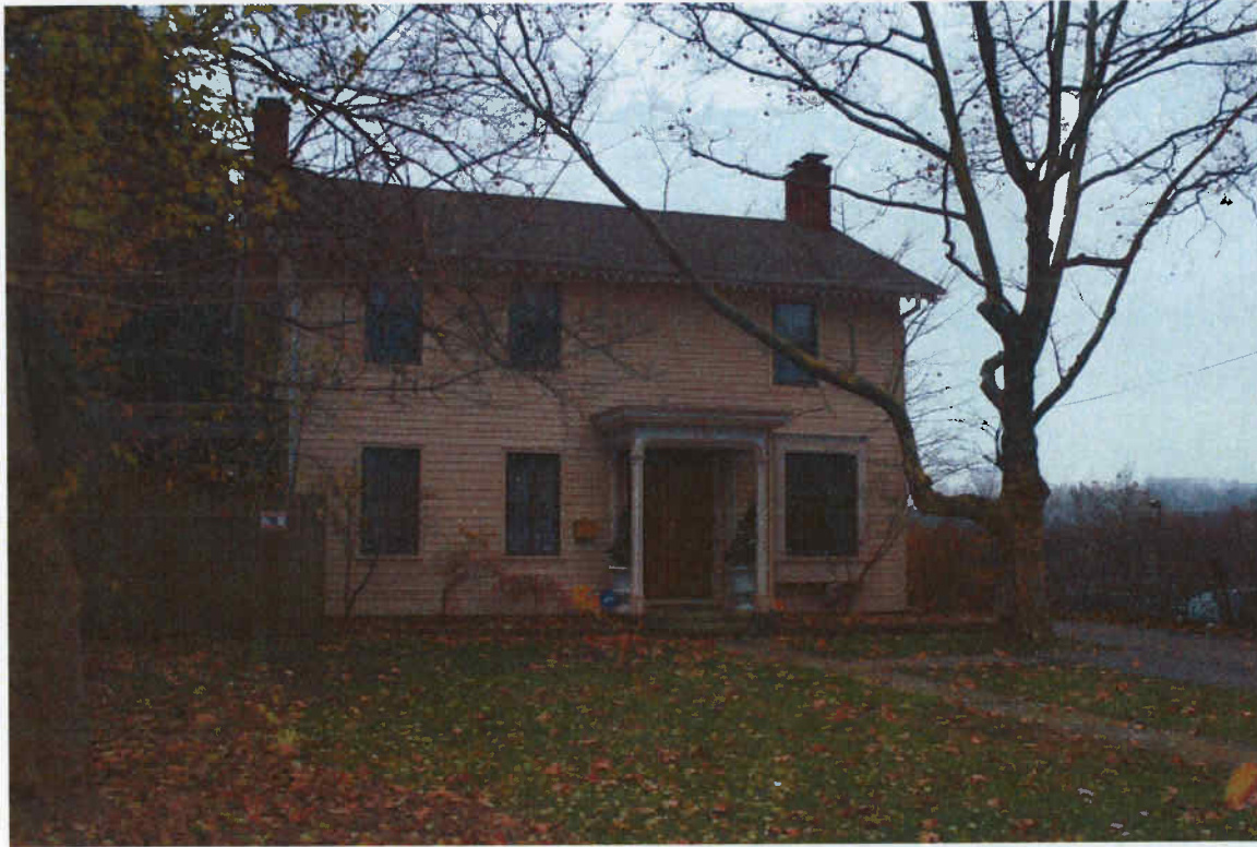
Photograph 9 – 120 Packard, Wines/Dean House, November, 2009