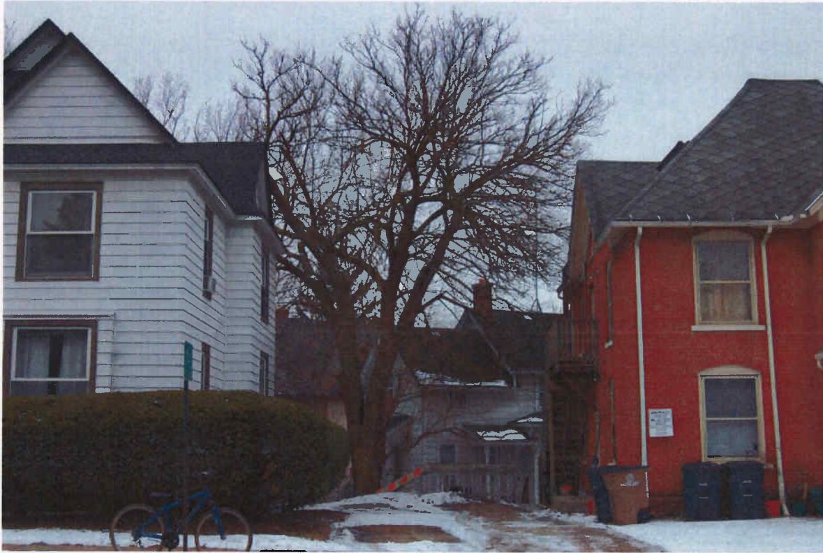
Photograph 15 – Mature tree between 308 and 314 Packard Street, February, 2010