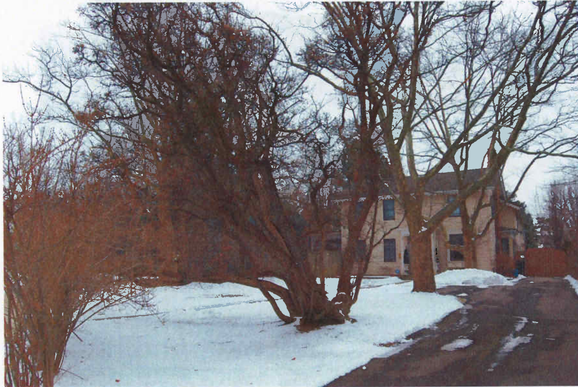
Photograph 10 – Mature lilac bush and trees at 120 Packard, February, 2010