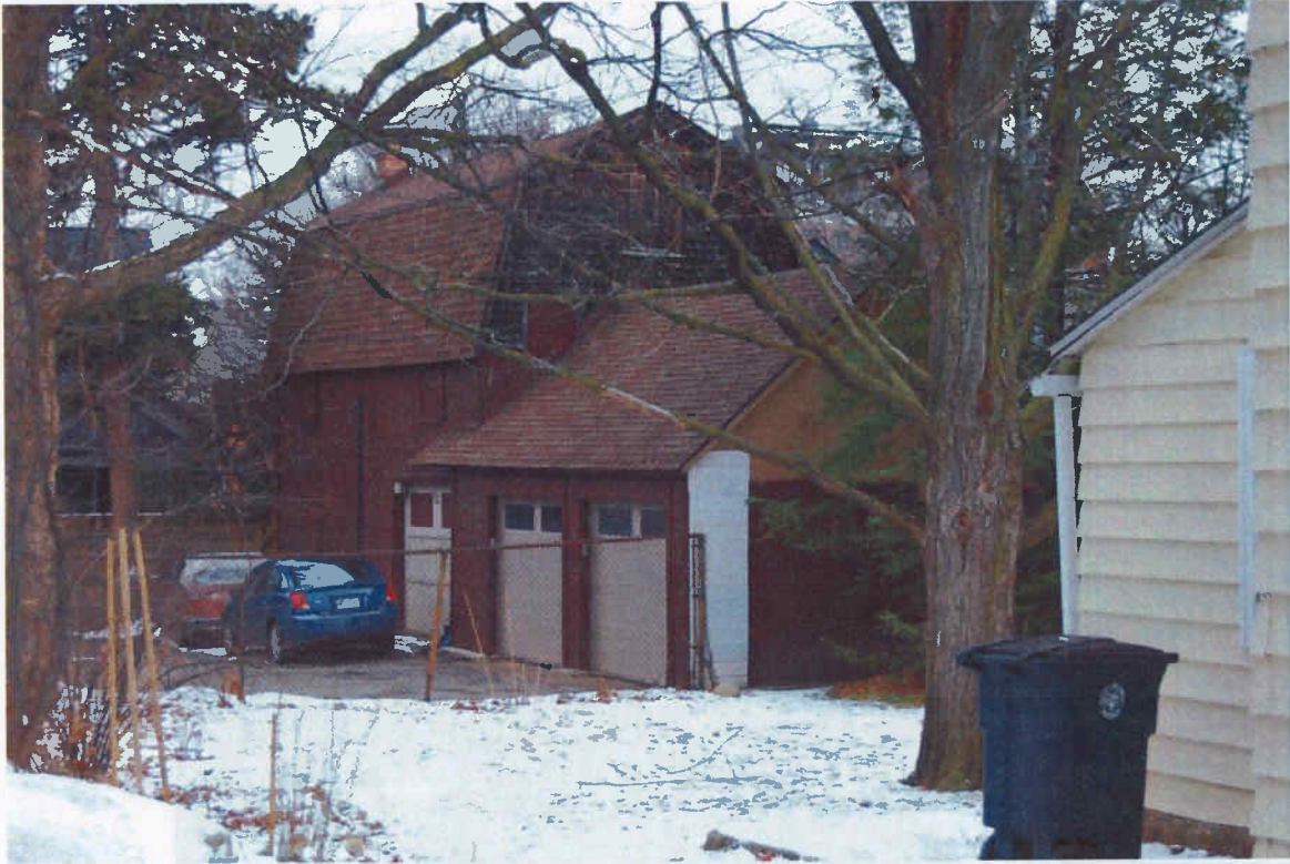
Photograph 14 – Barn at 215 Packard Street