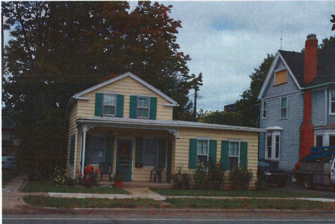
Photograph 5 – 450 South Fifth Avenue – Ditz/Stampfler House, September, 2009