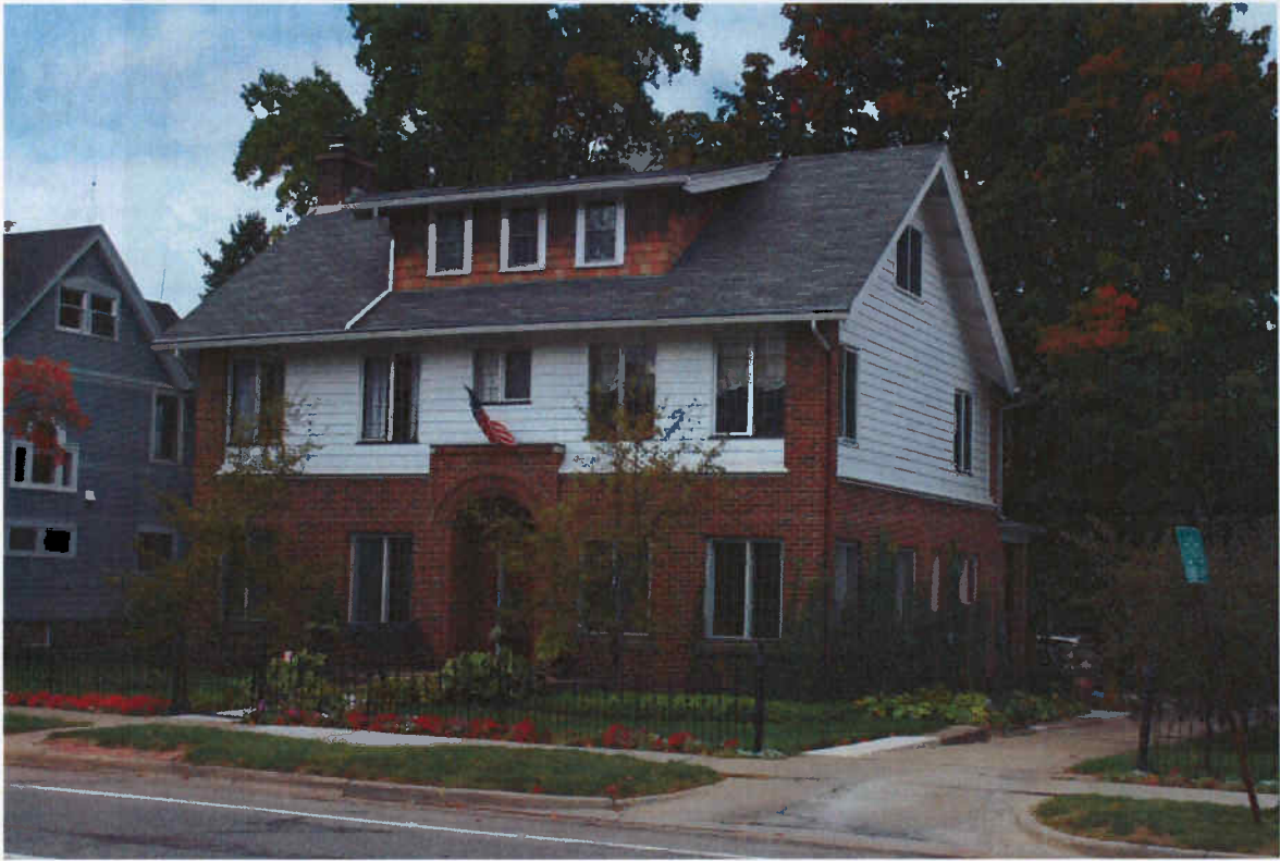
Photograph 3 – 438 South Fifth Avenue, designed by Herman Pipp, September, 2009