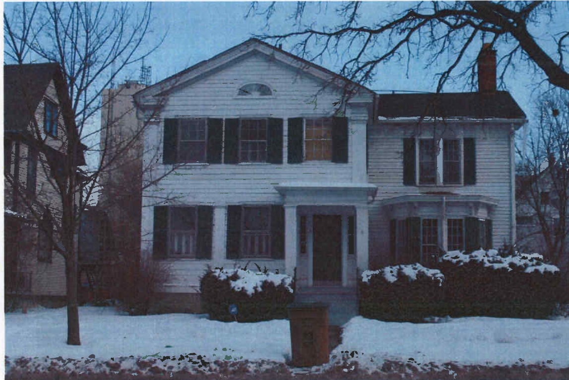
Photograph 6 – 415 South Fifth Avenue, Gaskell/Beakes House, February, 2010