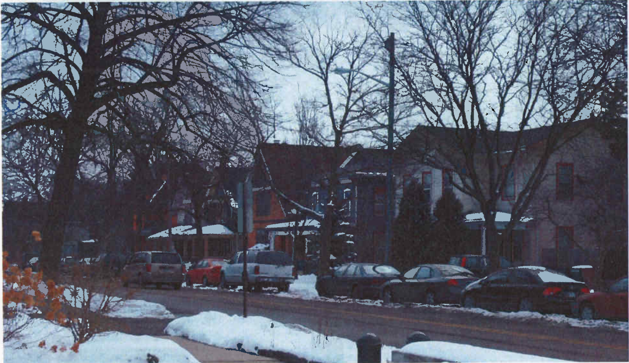
Photograph 2 – West side of Fourth Avenue looking south, February, 2010